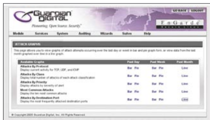
Figure 2. Attack graphic

With the EnGarde WebTool, setting up your firewall and firewall rule set is as easy as 1.2.3 Creating port forward rule sets can be done and maintained in a matter of seconds, obviously an understanding of ports is needed when using the Web Tool firewall setup.